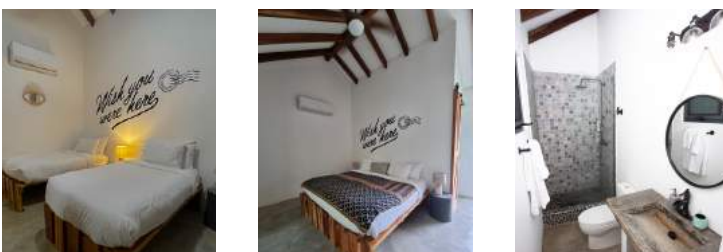
STANDARD INNS X2