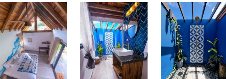
GARDEN CASITAS X2